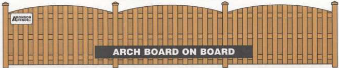
ARCH BOARD ON BOARD