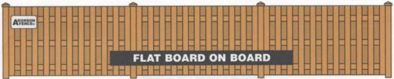
FLAT BOARD ON BOARD