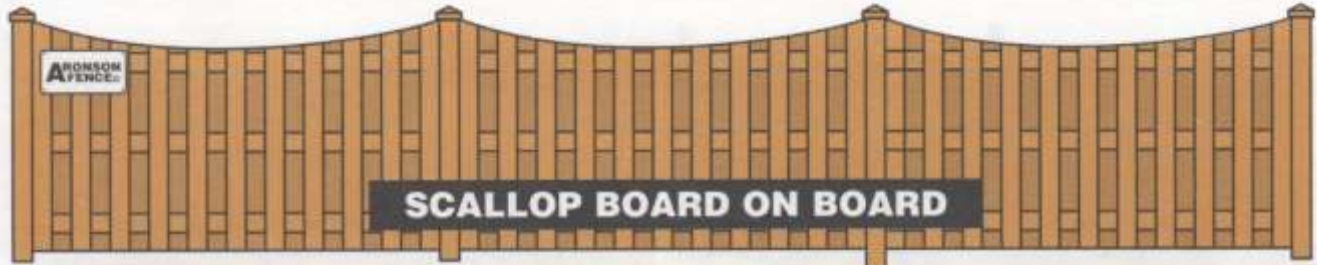
SCALLOP BOARD ON BOARD